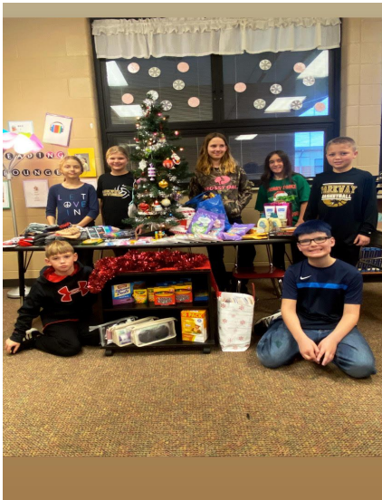
Students sitting around the gifts they brought in for the residents of Divine Rehabilitation.

This item drive was a huge success and brought in over 130 items, including but not limited to word find books, lip balm, hand lotion, crayons, markers, individually wrapped snacks, and fuzzy socks! The Divine residents and Parkway staff would like to thank students who brought in gifts and any adults who helped their child pick out appropriate gifts. Thank you to all involved for helping bring a little bit more holiday cheer to Shane Hill.